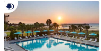
DoubleTree Resort by Hilton Myrtle Beach Oceanfront