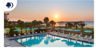
DoubleTree Resort by Hilton Myrtle Beach Oceanfront